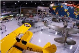
EAA Aviation Museum (3.7 mi. away from hotel)

1410 Algoma Blvd, Oshkosh, WI 54901 (920) 235-6903