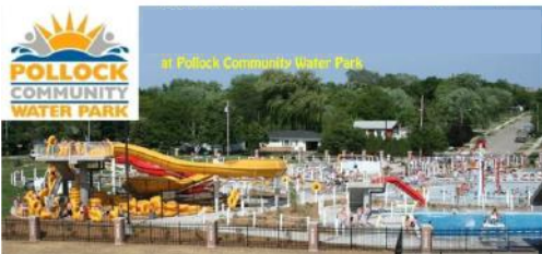
Pollock Community Water Park (2.5 mi. away from hotel)

3000 Poberezny Rd, Oshkosh, WI 54902 (920) 426-4800