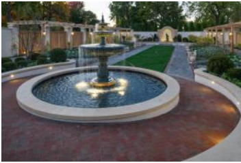
Paine Art Center (2 mi. away from the hotel)

1410 Algoma Blvd, Oshkosh, WI 54901 (920) 235-6903