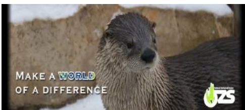
Menominee Park Zoo (2.5 mi. away from hotel)

1550 Taft Avenue, Oshkosh, WI 54902 (920) 232-5319