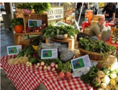
Saturday Morning Farmer's Market Open 8-12:30

520 Pratt Trail, Oshkosh, WI 54902 (920) 236-5082